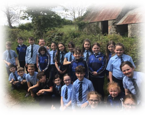
P5/6 enjoying the Daily Mile